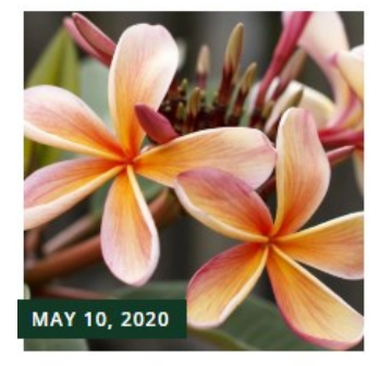
Home-school partnerships with Pacific families – a good time for nurturing relationships

For any questions regarding Ipu Kererū please email <u>blog@nzare.org.nz</u>.