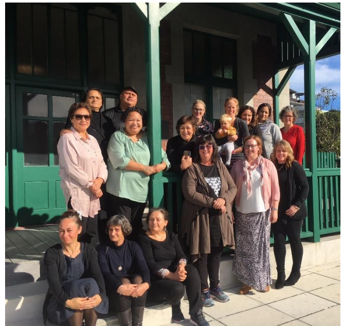
NZARE Council Members 2018

Membership is open to Established and Emerging Researchers. Benefits include: networking with peers; access to the Association's Journal and regular newsletters; discounts to events; membership of special interest groups and others. The best way to grow the Association is by word-of-mouth. If there is a new research member in your organisation, how about meeting them for a coffee and suggest they might like to join - forward them a copy of this newsletter, or show them a copy of the journal.