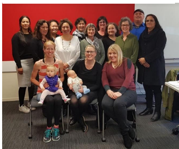
NZARE Council Members 2018

Membership is open to Established and Emerging Researchers. Benefits include: networking with peers; access to the Association's Journal and regular newsletters; discounts to events; eligibility for NZARE awards nominations; membership of special interest groups and others. The best way to grow the Association is by word-of-mouth. If there is a new research member in your organisation, how about meeting them for a coffee and suggest they might like to join - forward them a copy of this newsletter, or show them a copy of the journal.